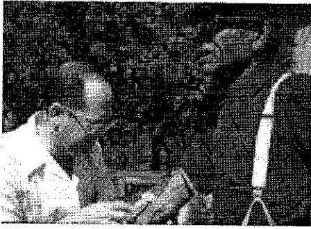
Taking a blood sample as part of the Tuskegee Syphilis Study

PHS researchers attempted to prevent them from getting treatment, thus depriving them of chances for a cure. A PHS representative was quoted at the time as saying: "So far, we are keeping the known positive patients from getting treatment." [19]