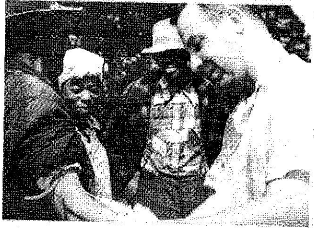
A doctor draws blood from one of the Tuskegee test subjects.

The Public Health Service, working with the Tuskegee Institute, began the study in 1932. Investigators enrolled in the study a total of 600 impoverished sharecroppers from Macon County, Alabama; 399 who had previously contracted syphilis before the study began, and 201 [2] without the disease. For participating in the study, the men were given free medical care, meals, and free burial insurance. They were never told they had syphilis, nor were they ever treated for it. According to the Centers for Disease Control, the men were told they were being treated for "bad blood", a local term for various illnesses that include syphilis, anemia, and fatigue.