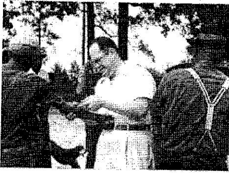
Subject blood draw, c. 1953

histories of patients who had already contracted syphilis but remained untreated for some time.