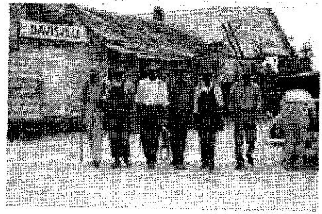
Group of Tuskegee Experiment test subjects

After penicillin was found to be an effective treatment for syphilis, the study continued for another 25 years without treating those suffering from the disease. After the study and its consequences became front-page news, it was ended